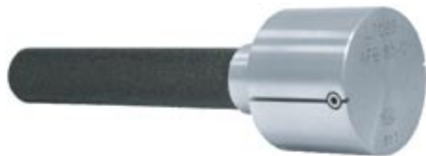
BLIND AIR PROBE WITH HEAVY DUTY HANDLE