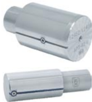
THRU-HOLE & BLIND STYLE AIR PROBES

Air probe styles vary depending on how close the air jets are to the leading edge of the probe body. "Thru-hole" style probes have gaging nozzles located near the center of the probe body. "Blind" or "Super-blind" probe styles have nozzles located near the lead edge. (See pages 16 & 18 for air probe dimensional specifications.)